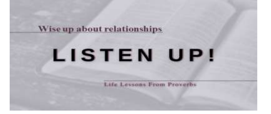
Sunday, August 8, 2021 AVBC